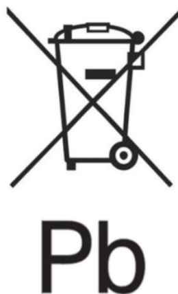
Figure 2 – Example of marking with symbol for separate collection according to Annex VI Part B and with the chemical symbol “Pb” for the heavy metal Pb content according to Articles 13.4 & 13.5